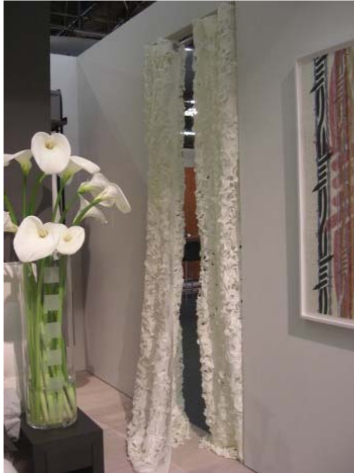
A doorway in the bedroom featured grommet-hung curtains made of laser-cut fabric that made them into suedelike lace.