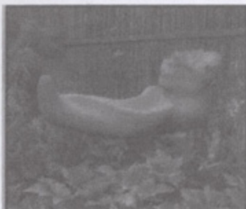
A chile pepper sculpture on display in a garden.

For more information, visit http://www.archdigesthomedesignshow.com/ or e-mail jkirsh@jankirsh.com .